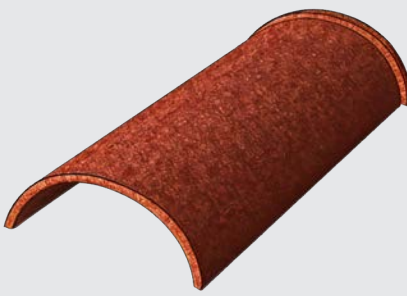
Round Ridges Hip 420mm x 150mm