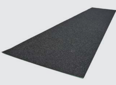
Flat Sheet 2000mm x 450mm